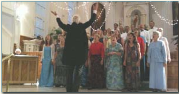
Performing in the Quebec City Summer Music Festival and at a centennial celebration, the Church of Saint-Gabriel de La Durantaye