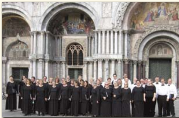
During summer tours, members of the Chorale singing in Europe, from Vienna to Venice.