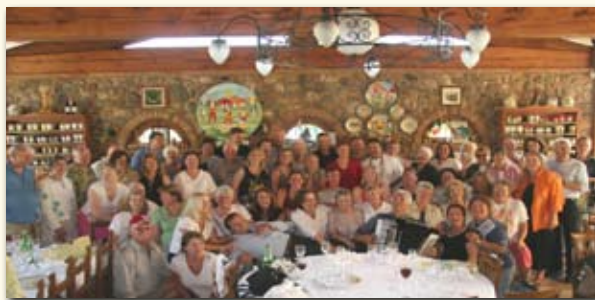
Celebrating a successful tour at the Italian Winery, Redaelli de Zinis, in the Lake Garda region.